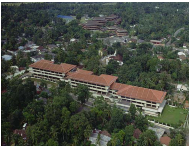
A bird’s-eye view of the International Water Management Institute (IWMI) in Colombo where the PUB Secretariat is housed.